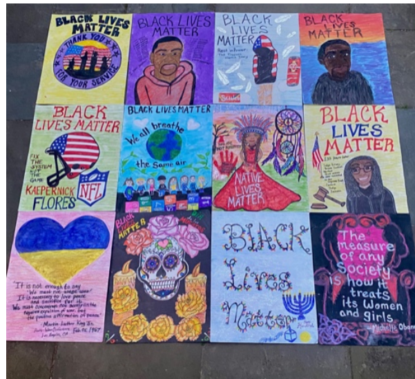
Artwork by Cookie Rivera