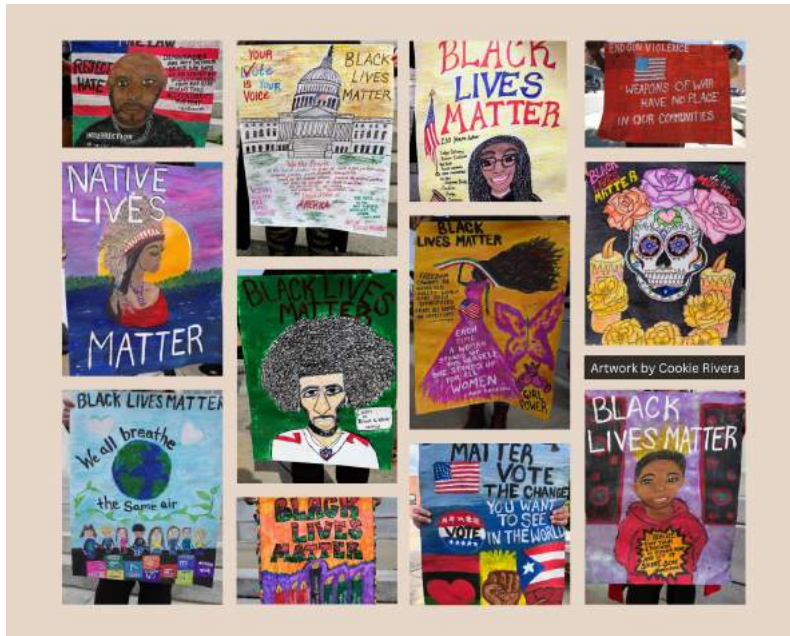
Artwork by Cookie Rivera