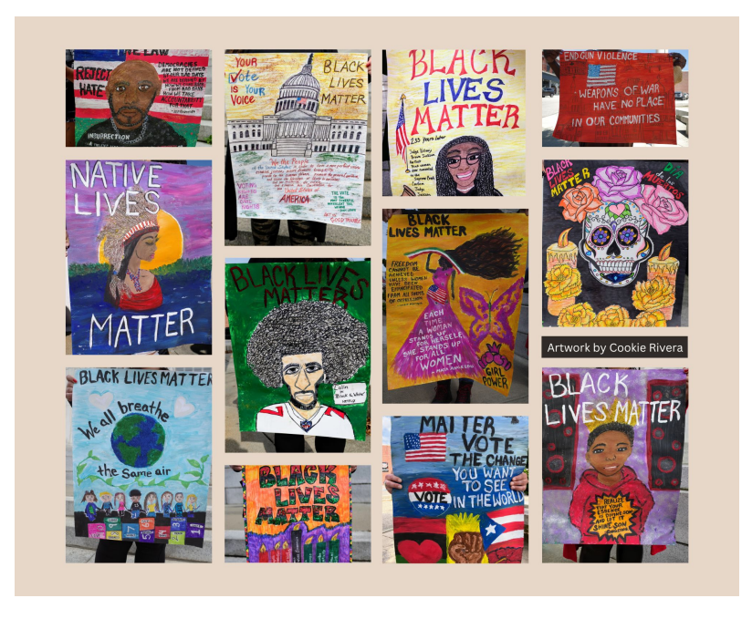
Artwork by Cookie Rivera