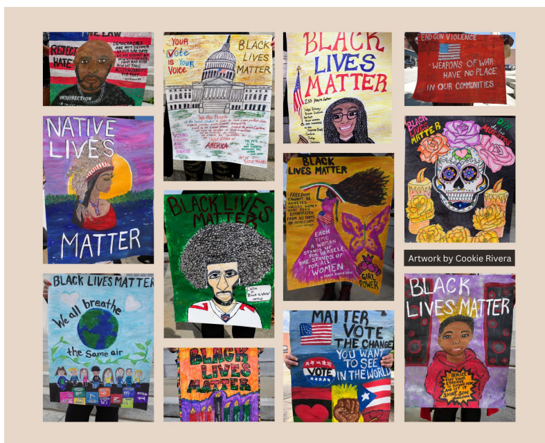
Artwork by Cookie Rivera