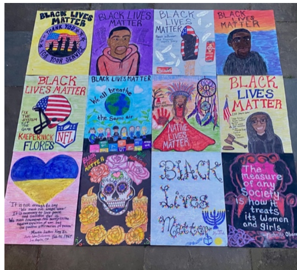
Artwork by Cookie Rivera