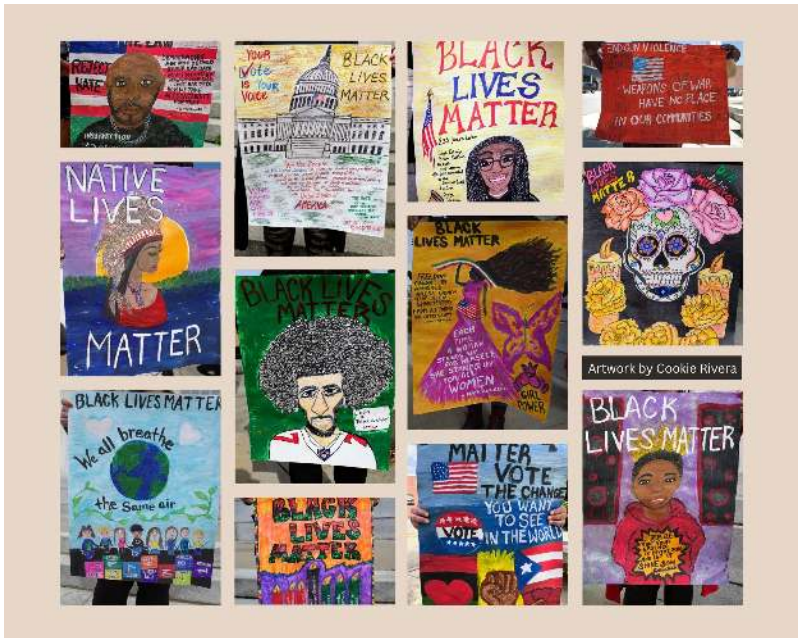
Artwork by Cookie Rivera