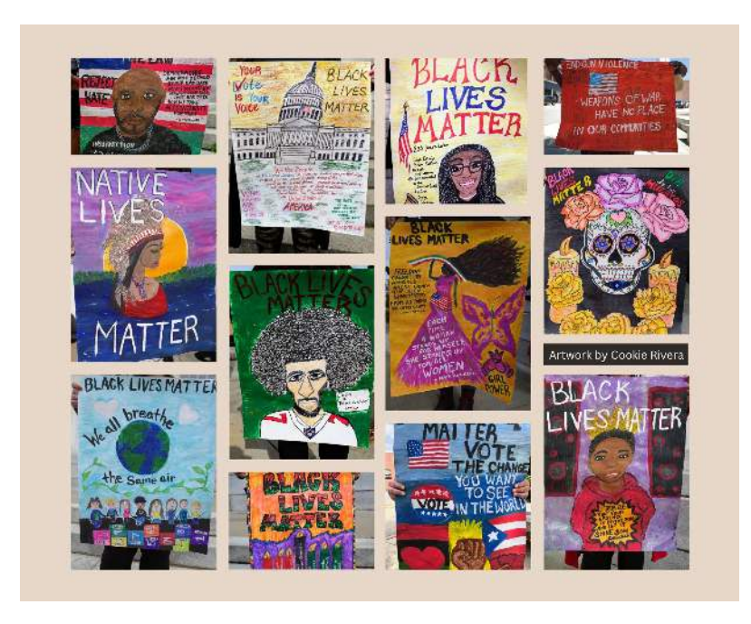
Artwork by Cookie Rivera